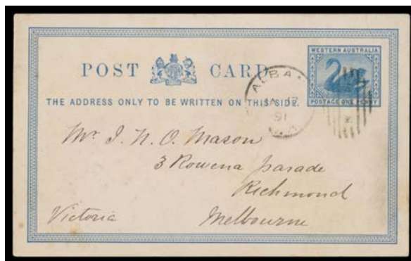
Ex Lot 808

808 C/CL A/B 1891 1d Postal Card to Vic with Albany KGS duplex; 1898 Orient Line cover to GB with GB 2½d tied by Albany PO duplex; and 1913 OHMS cover with 2d punctured 'OS' pair, 'CUE' cds & superb DLO boxed d/s. (3)