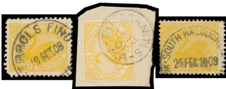
Ex Lot 817