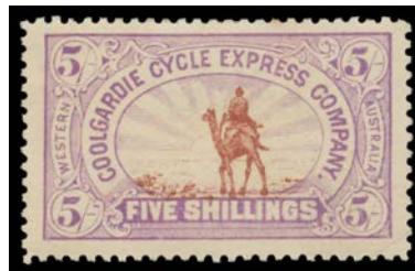
Ex Lot 806