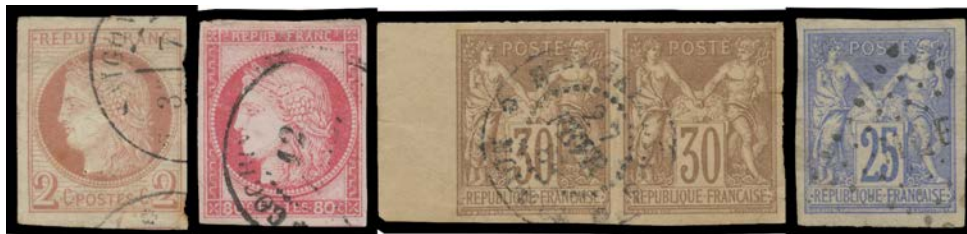
Ex Lot 1014