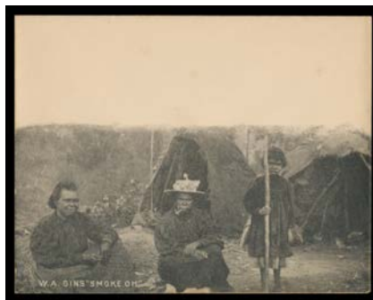
Ex Lot 814