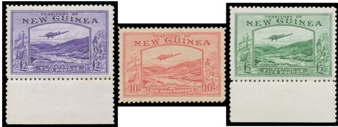
Ex Lot 1155

1155 **O 1925-39 Issues complete including 'OS' Overprints, the 1935 Bulolo £2 (browned gum) & £5 are marginal & unmounted, about 99% mint, also a few imprint blocks, condition rather mixed. (150+) 750