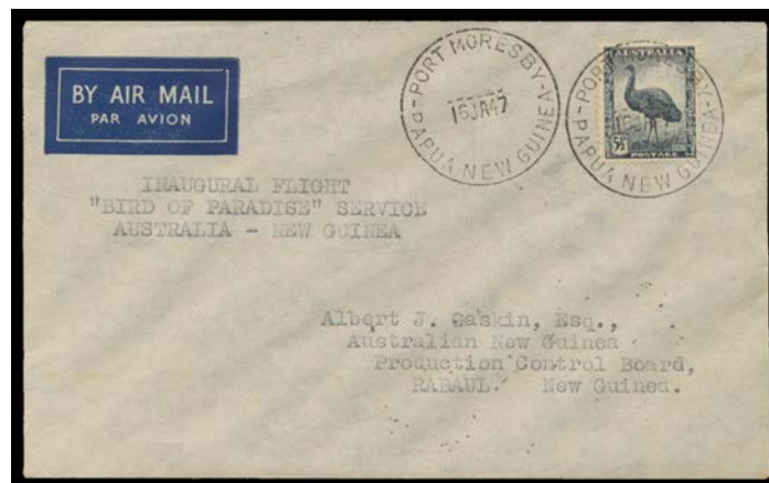
Ex Lot 1259

1259 C** A/A+ 1947 (Jan 8) Rabaul-Sydney flight cover with the black & blue Qantas label & signed by the pilot "J Bonnington"; also plain typed cover Port Moresby-Rabaul AAMC #P165 with cds of "16JA47" & Rabaul arrival b/s of 17JA47, plus the similar Sydney-Rabaul label (pristine, unmounted). Ex John McNabb : sold at the Prestige auction of 12.10.2012 for $862. [The entire Sydney-Rabaul mail disappeared. Unused vignettes are the only survivors of the flight to Port Moresby. The Port Moresby-Rabaul cover is the only recorded proving cover for the inwards flight. #P165 is not priced & this intermediate is not even listed] (3 items) 600