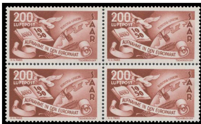
Ex Lot 1046