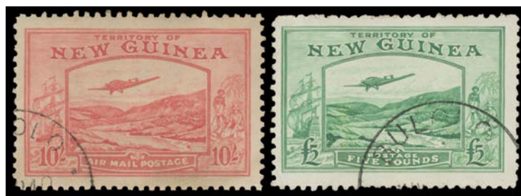
Ex Lot 1157

1155 **O 1925-39 Issues complete including 'OS' Overprints, the 1935 Bulolo £2 (browned gum) & £5 are marginal & unmounted, about 99% mint, also a few imprint blocks, condition rather mixed. (150+) 750