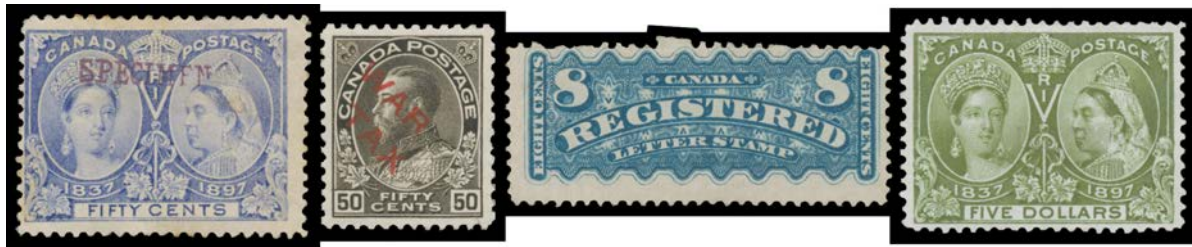
Ex Lot 966