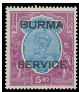
Ex Lot 856