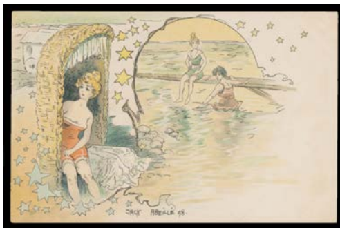
Ex Lot 919