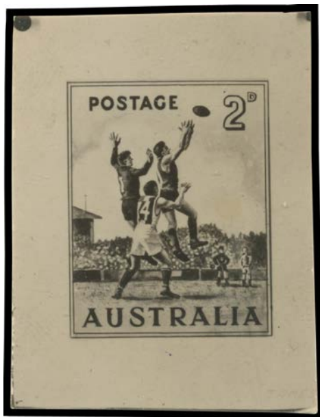
Ex Lot 188