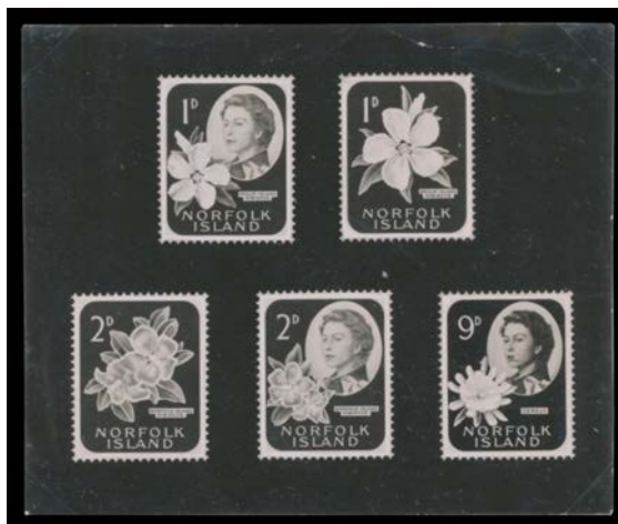
Ex Lot 1224