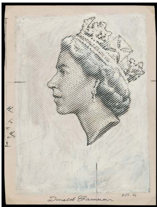
Ex Lot 187

187 P/*/C A/A- ESSAYS: Original artwork by Donald Cameron for QEII definitive issues including Queen's head in ink & china white (166x121mm) dated "DJC '54" and autographed similar to 1957 7½d violet (die engraved by him in late 1954), another in ink & china white (166x74mm) autographed and endorsed "sublimation" similar to 1959 3d green, also pen & ink drawing (210x126mm) of child for 1957 Christmas issue, plus some matching stamps, FDCs and Christmas cards signed by him. (63 items) 400