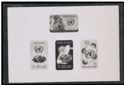
Ex Lot 44

44 P/*/C TERRITORIES: Photographic Essays by Peter Morriss including PNG 1965 United Nations composite piece with 5d value (similar to issued 6d) and three different 2/3d values side-by-side (two of which are similar to the issued 1/- & 2/- values; the other an unadopted design) and Nauru 1965 Pictorials 3/3d Bird similar to issued stamp but with different inscription format, also PNG, Nauru and Christmas Island 1950s-60s FDCs autographed PE Morriss and issued stamps mounted on pages signed by him, fine condition. [see also Lots 188 954 and 1224] (90+) 400