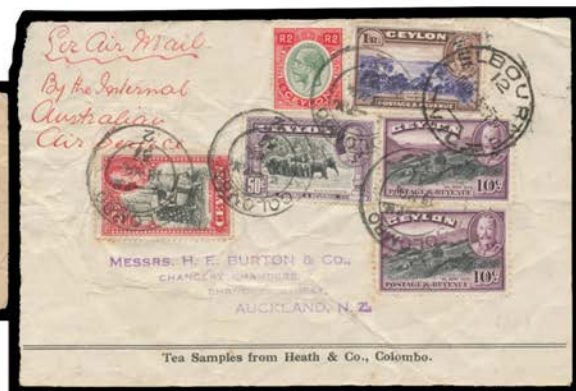
Ex Lot 970