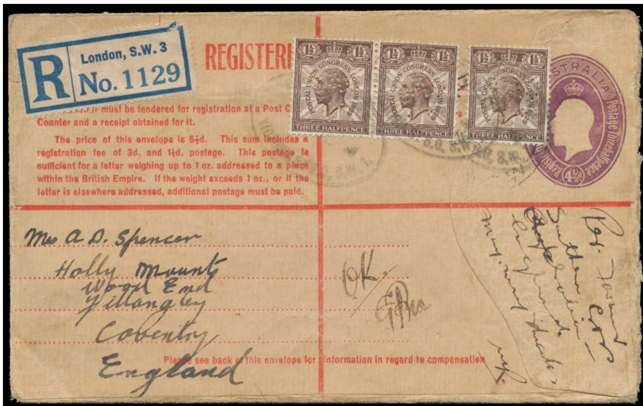
Ex Lot 288

287 C B 1919 (Aug 6) Adelaide-Minlaton AAMC #20a unnumbered PPC per Harry Butler cancelled on arrival with 'MINLATON' squared-circle, minor blemishes but in far above average condition, Cat $550. 350