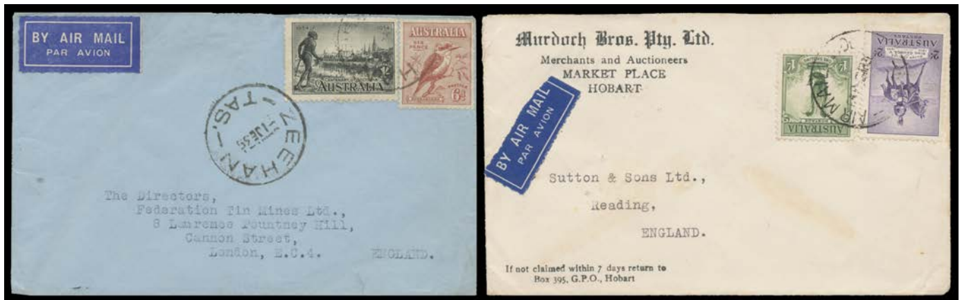
Ex Lot 301