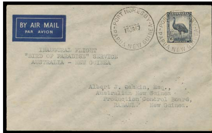
Ex Lot 1259