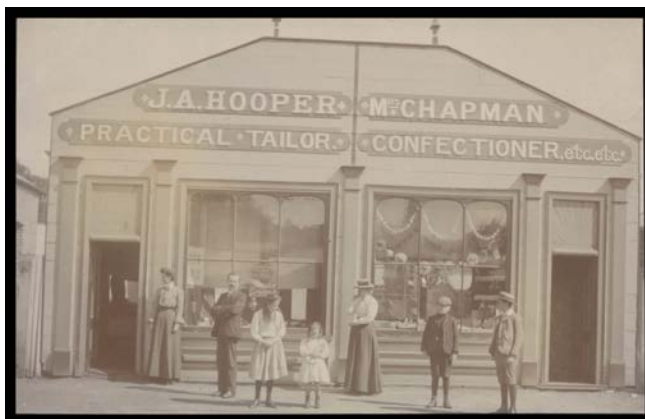
Ex Lot 359

359 C Box including Victoria with Casterton "JA Hooper - Mrs Chapman/Practical Tailor - Confectioner" real photo card & similar card but sign now reads "JA Hooper - Mrs Hooper" plus Main Street with Pub (over-exposed), Outtrim "Loading Hay", Emerald "Hydraulic Sluicing", Australian Rules Football "A Mark of Memory/Melbourne Football Scene" with vignette view of game in progress, ACT with "Eastlake" real photo aerial view, NSW Harbour Bridge x3, etc, also 1908 US Fleet x2 including "Exhibition Building" vignette view, etc. (150+) 300