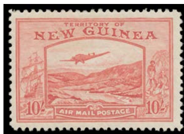
Ex Lot 1158

1158 * A B1 1925-27 Hut Airs (the 5/- a corner example with Short 'l' in 'AIR', unmounted), and 1939 Bulolo Airs, mostly lightly to very lightly mounted, Cat £1350. (27)