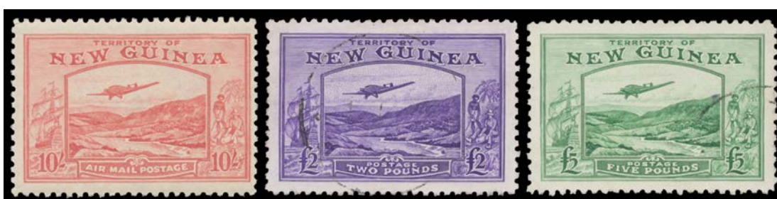
Ex Lot 1156

1156 *O 1925-39 Issues with mint Huts, Hut Airs, Dated Birds, Dated Airs, Undated Birds, Undated Airs, 1939 Bulolos etc, and used 1935 Bulolo £2 & £5, 'OS' Overprints Huts, Dated Birds to 2/- & Undated Birds to 2/-; also NWPI mint group to 10/- including 1918 Surcharges & an extra 1d on 1/- used; generally fine to very fine. (164)