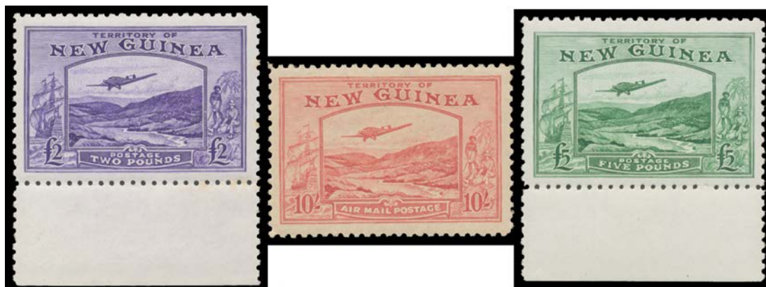
Ex Lot 1155

1155 */**O 1925-39 Issues complete including 'OS' Overprints, the 1935 Bulolo £2 (browned gum) & £5 are marginal & unmounted, about 99% mint, also a few imprint blocks, condition rather mixed. (150+)