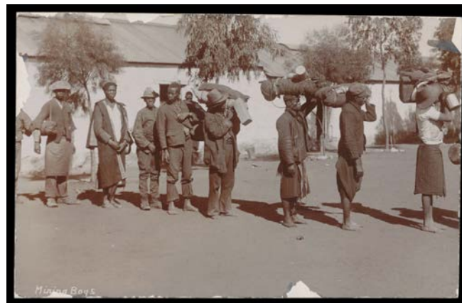
Ex Lot 950

950 C SOUTH AFRICA: Two large albums of mostly topographicals from Cape Town, Durban, Johannesburg & some from smaller towns, a few Boer War & Goldmining, also a few Rhodesia, condition variable but many are fine to very fine with some postmark interest. (500+) 350