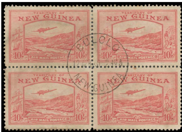
Ex Lot 1162