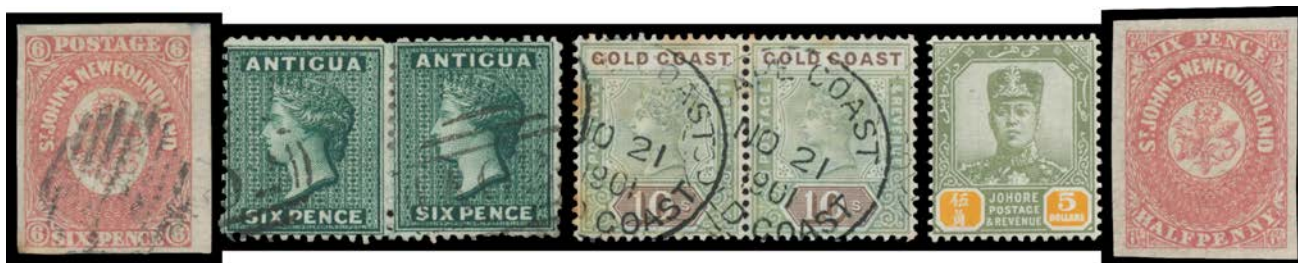
Ex Lot 838

837 *O British Empire array on stockcards & in Hagner album, good representations from many Colonies/Dominions including Canada, Hong Kong, India, Pacific Islands, West Indies, British Africa, etc, condition rather mixed but many fine to very fine stamps noted. Inspection recommended. (many 100s) 1,000