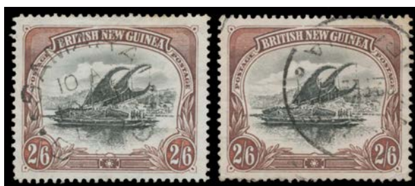
Ex Lot 825