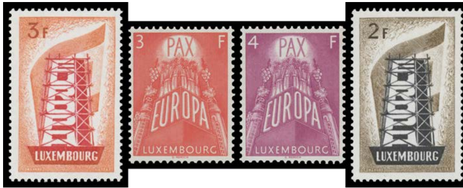
Ex Lot 830

830 ** A Modern European collection with virtually complete Spain 1951-62 issues, Spanish Andorra 1963-97 (no 1972 Europa), Lithuania 1991-2008, Slovenia 1991-2004 & Germany 2000-2011, also Luxemburg Europa 1956 & 1957 sets, apparently all unmounted, STC £5200+. Thematics galore including loads of M/Ss. (Qty) 2,200