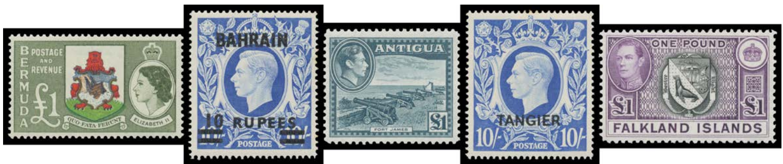
Ex Lot 831

830 ** A Modern European collection with virtually complete Spain 1951-62 issues, Spanish Andorra 1963-97 (no 1972 Europa), Lithuania 1991-2008, Slovenia 1991-2004 & Germany 2000-2011, also Luxemburg Europa 1956 & 1957 sets, apparently all unmounted, STC £5200+. Thematics galore including loads of M/Ss. (Qty) 2,200