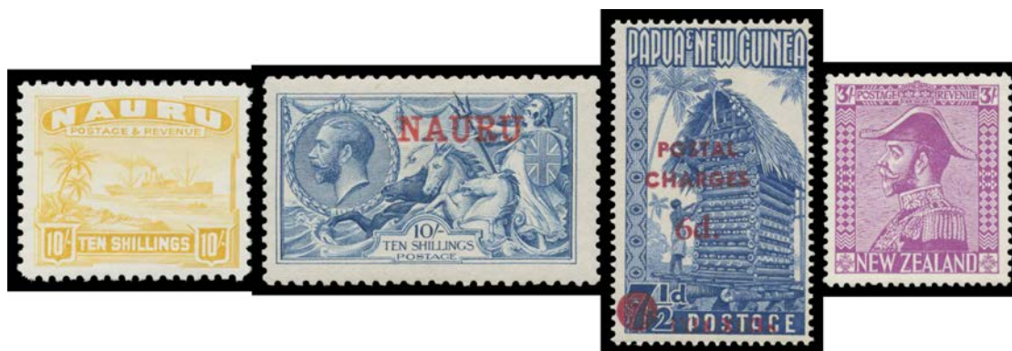
Ex Lot 827