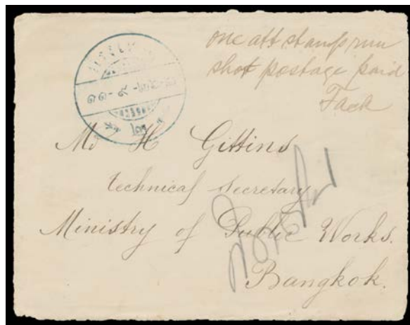
Ex Lot 1328

1328 C A/B POSTAL HISTORY: 1907 'No Stamps' Provisional Markings at Bangkok 2 local cover front to the Ministry of Public Works endorsed "one att stamp run/short postage paid" and signed "Fack" in black, Siamese-language Bangkok 2 cds of 11.12.1907 in blue; and local cover similarly endorsed in red, bilingual cds of 13.12.07. Ex Len Colgan: sold at the Prestige auction of 24.6.2011 for $966. Separate Philatelic Association of Thailand Certificates (2011). [The illustration is above Lot 1329] (2)