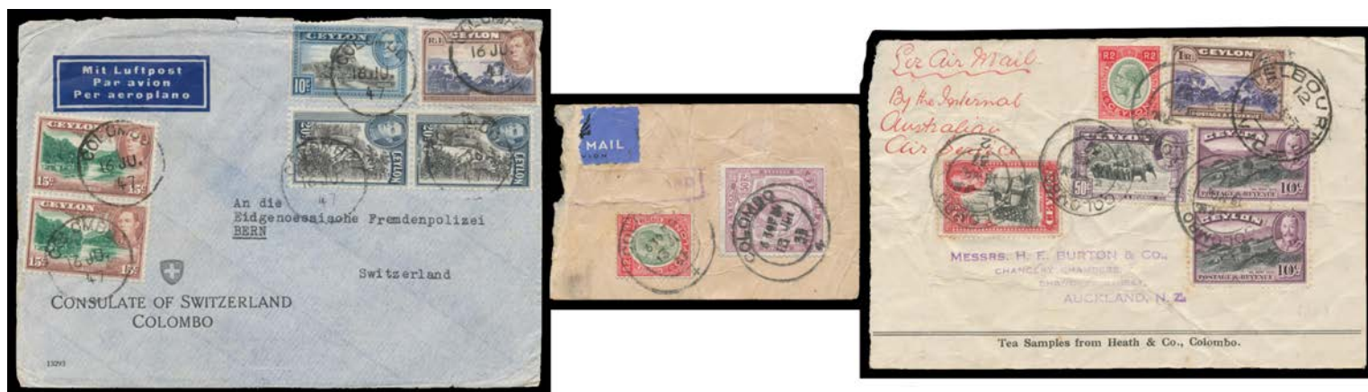
Ex Lot 970