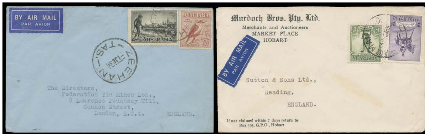
Ex Lot 301

301 C/CL Three volumes of pre-decimal commercial & philatelic covers with better items including 1918 registered at 'JERVIS BAY/NSW' with 4d orange (cover faulty), 1922 to GB with 2d scarlet & 4d violet, KGV 1½d Letter Card "RIVER YARRA" to GB, 1931 'RETURNED REGISTERED LETTER' envelope from Brisbane DLO, 1930s to GB with Vic Centenary 1/-, 1/- Anzac, 2/- Jubilee or 9d NSW Sesqui pair, another at 12/1d rate with 5/- Roo, 1941 Clipper cover to USA with 10/- Robes, 1940s to USA with £1 Robes, 1946 registered to USA with rare rubber 'GLEN IRIS/SE6' d/s, 1950 to GB with Stamp Centenary pairs, 1951 registered air to Czechoslovakia with Customs cachets & labels, 1951 to GB with Federation 3d pairs, 1957 air to USA with 4d booklet pane, 1958 to GB with War Memorial pair, 1963 registered air to USA with 10/- Arms, etc, condition variable. Another very good lot, especially for "usage". (few 100)