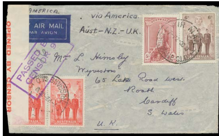
Ex Lot 323