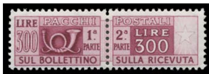
Ex Lot 1101

1101 **/* A B1 PARCEL POST: 1946-52 Winged Wheel Watermark 25c to 500L horizontal pairs Mi P66-80 (SG P687-701), very lightly mounted on the left-hand units only, Cat €2800 (£3500) for unmounted. (15 pairs) 350 1104 **/* A SAN MARINO: 1945 50 Years imperf M/S (lightly mounted at the corners only), 1951 Air 1000L corner example (**), 1952 Columbus 200L (**), 1957 500L Panorama, and Parcel Post 1953 300L marginal pair (**), Cat €1200. 350