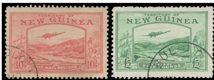
Ex Lot 1157

1157 F/V A/B Undated Birds 2/- to £1, 1935 Bulolo £2 & £5, 1939 Bulolo 9d to £1, and a few low values, a few minor blemishes, Cat £1700+. (22) 750 1159 V A 1932-34 Undated Birds 2d 3d 5d 6d & 2/- to £1, 1939 Bulolo 5d (vertical) & £1, all in horizontal pairs, Cat £760+. (20) 400