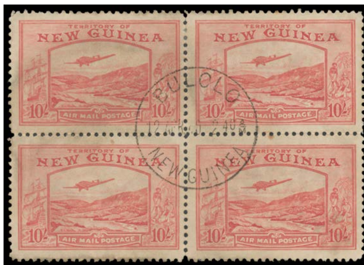
Ex Lot 1162

1157 F/V A/B Undated Birds 2/- to £1, 1935 Bulolo £2 & £5, 1939 Bulolo 9d to £1, and a few low values, a few minor blemishes, Cat £1700+. (22) 750 1159 V A 1932-34 Undated Birds 2d 3d 5d 6d & 2/- to £1, 1939 Bulolo 5d (vertical) & £1, all in horizontal pairs, Cat £760+. (20) 400