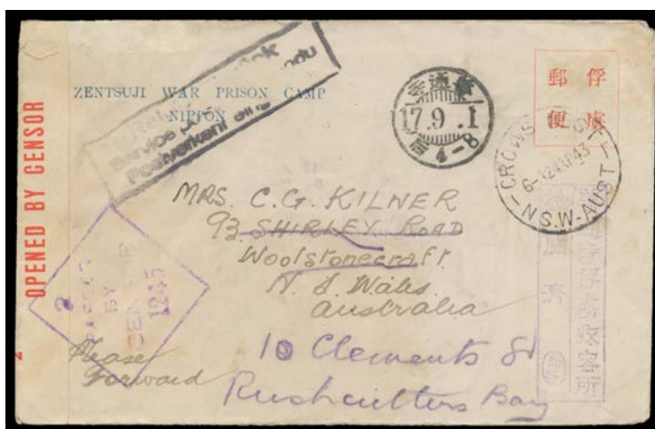
Ex Lot 344