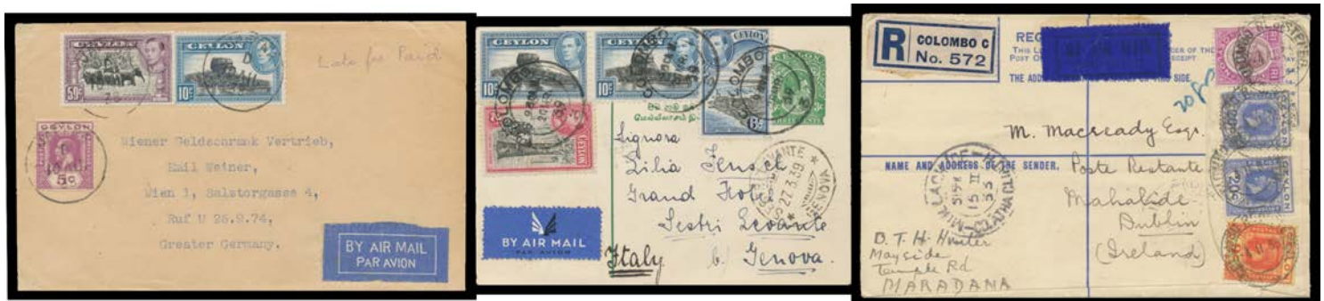
Ex Lot 971