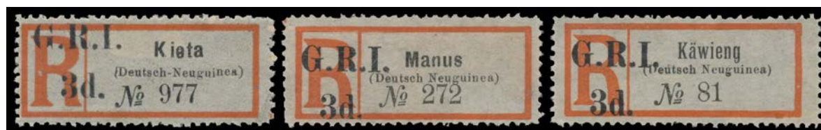
Ex Lot 1149

1148 *DO Selection with Overprints on DNG to '3d.' on 30pf, 3d registration label SG 35f, a few Overprints on Marshalls, some postmark interest including 'NAURU' on German Marshalls 3pf 10pf 20pf on piece & 50pf, also a few Samoa GRIs to '6d.' on 50pf on piece & '1d.' on 10pf used pair, etc, condition rather mixed. ( 64 ) 500