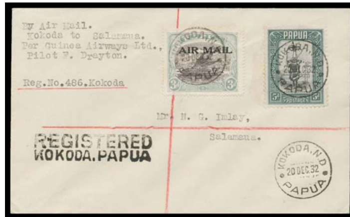
Ex Lot 1254

1251 C B 1927 (Jan 29) commercial cover to the Northern Territory with Bicolours 1½d x3 tied by 'BUNA BAY/PAPUA' cds, straight-line 'REGISTERED' h/s, Brisbane (7.3) & superb 'DARWIN NT/13AP27/AUSTRALIA' arrival b/s, minor soiling. Transit by the scenic route, taking a remarkable 46 days to arrive. 400