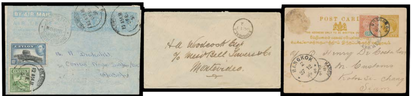
Ex Lot 972