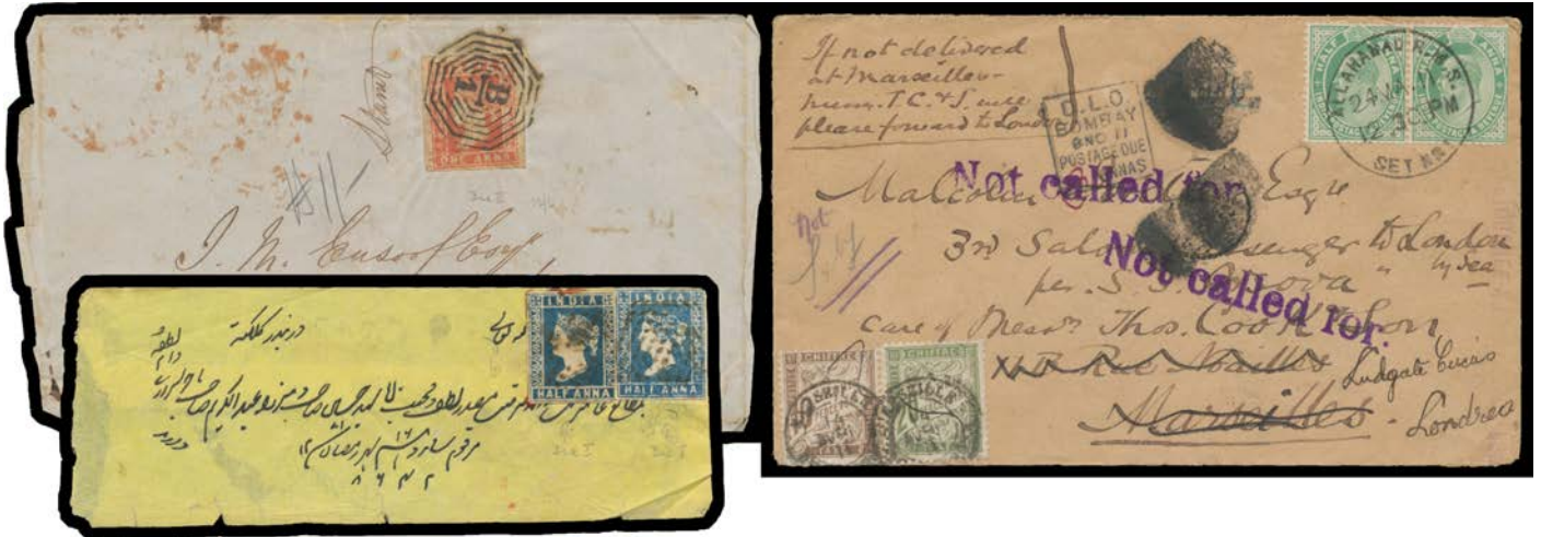
Ex Lot 1090

1090 C Covers & Stationery including 1855 with 1/2a blue x2 on yellow envelope (attractive), 1858 part-outer with 1a red, 1858 with 1/2a blue tied '138' cancel and 'BOMBAY GPO/1 Dely' unframed b/s, 1872 East India Railway Electric Telegraph Department lettersheet with 'LOCAL/TPO BENGAL' oval d/s and North West Provinces 'F/NWP/No3' transit, 1911 with 'ALLAHABAD RMS/SET No1' TPO cds & French postage dues, WWI Forces with 'HS TAKADA/On Active Service' cachet, 1922 insured parcel tag with 'V/P/ESPLANADE/(CALCUTTA)' label, registered & official mail, illustrated advertising & instructional markings noted a couple of 'TOO LATE' types, plus Convention States group including 1903 QV 1/2a tied 'GWALIOR-STATE/ VICEROY'S CAMP POST OFFICE' hooded-circle d/s and 1910 registered with KEVII 3p 'CHAMBA/STATE' overprints x10 & provisional 'R' cachet on blank label, 1894 1/2a envelope 'PATIALA/STATE' with 'BATHINDA RY STN' squared circle & 'POSTAGE DUE' cachet, eight inwards items from Germany & 1877 illustrated US cover to Jubbulpoor, postmark interest, condition mixed but many fine. (approx 130)