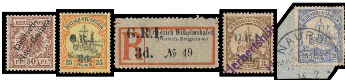
Ex Lot 1148

1148 *DO Selection with Overprints on DNG to '3d.' on 30pf, 3d registration label SG 35f, a few Overprints on Marshalls, some postmark interest including 'NAURU' on German Marshalls 3pf 10pf 20pf on piece & 50pf, also a few Samoa GRIs to '6d.' on 50pf on piece & '1d.' on 10pf used pair, etc, condition rather mixed. ( 64 ) 500