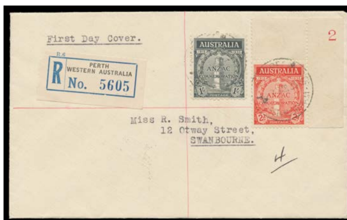
Ex Lot 265

265 C 1931-65 collection in high-quality Ka-Be pages & album with a variety of cachet-makers noted 1931 Kingsford Smith set on Mitchell cover, 1934 Macarthur set, 1935 ANZAC pair with 2d Plate Number single, 1936 SA Centenary on HMS "Buffalo" cover, 1953 Produce Food strips on one cover, 1956 Olympics with 'STATION PIER' cds (not FDI), 1962 Empire Games with 'VILLAGE-PERTH' cds & R label, Navigators on six covers, the majority unaddressed, mixed condition but many fine. (121) 600