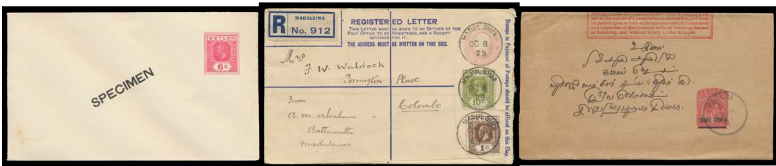
Ex Lot 977