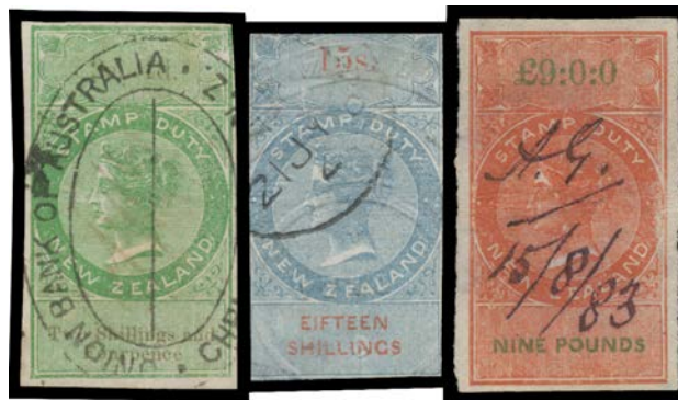
Ex Lot 1203