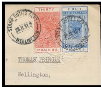
Ex Lot 1202