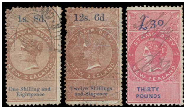
Ex Lot 1205

1204 F A - 1867 QV Lithos Imperforate £6/10/- orange & green Kiwi (2016) #R252a , margins close to good, 'OTAGO NZ/19MR69/ F' steel cds, Cat NZ$1250 for pen cancelled. 600