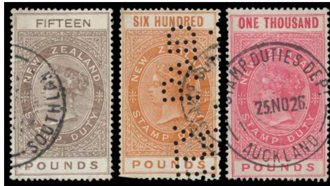
Ex Lot 1208