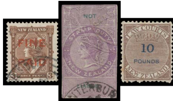
Ex Lot 1201