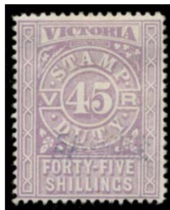
Ex Lot 489

488 * B/A 1884-96 Large Stamp Duty Litho £1/5/- pink & Typo £2 blue SG 243 & 276 both with diagonal Type 21 'SPECIMEN' Overprint Reading Upwards, the first a little aged, large-part o.g. Rare. [ Kellow Turner & McCredie recorded a mere two & one examples respectively] 400 T