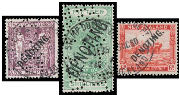
Ex Lot 1211

1211 O DENOTING: 1923-47 Overprints group including QV Long Type 15/- (punched), KGV 3d x2 and 6d (all punched) & 1/- x2, Coat of Arms 12/6d (punched), Pictorials 6d Harvester & 1/- Tul, KGV 6d & 1/-, fine condition, Kiwi (2016) Cat NZ$2000+. (19) 400