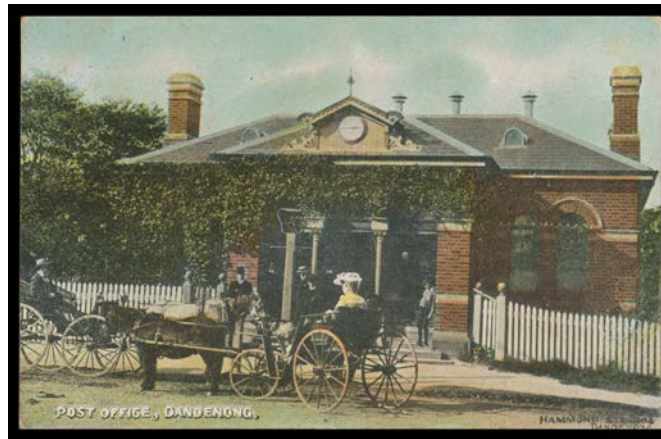
Ex Lot 358