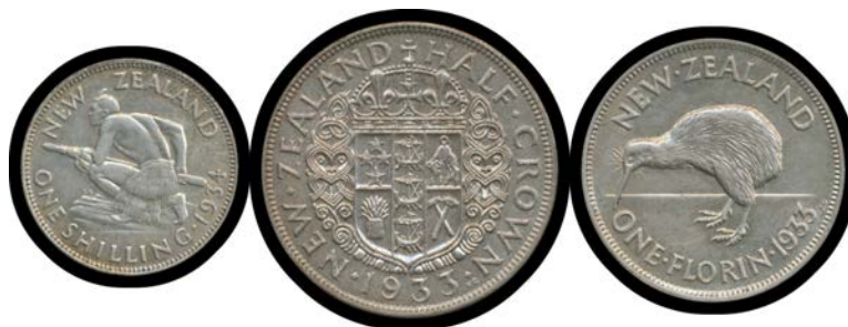
Ex Lot 463

462 - Uncirculated sets 1968, 1969 x3 (blue x2 plus brown wallet), 1970, 1980-81 x2 each, then 1982-86, plus 1986 $1 Royal Visit proof and $1 Commemoratives Unc x15. (30 items) 100