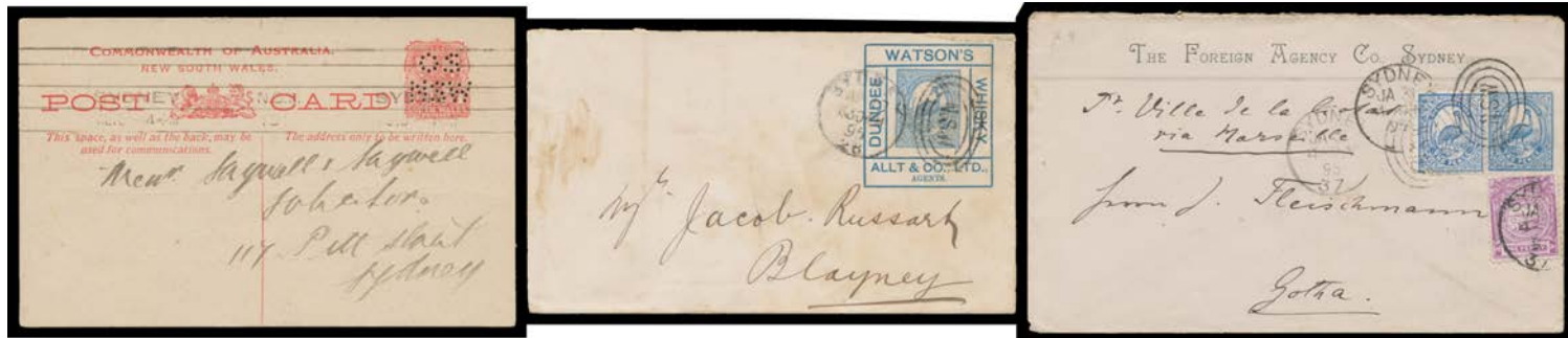
Ex Lot 338