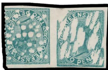
Ex Lot 204

204 OP Oddments on stockcards including NSW Laureates 1d forgery pair, Queensland Lined Background 2d defaced plate proof tête-bêche pair, postmark interest including Victorian BN 'M52' superb strike (rated RR), condition variable. (119 items)