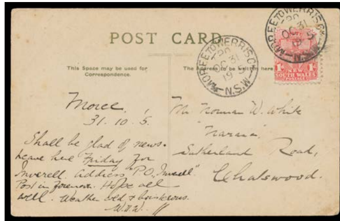
Ex Lot 206