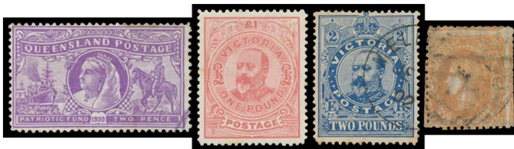
Ex Lot 203

203 O Single-volume collection with some better stamps including NSW Laureates to 8d including 6d pair, Registered Imperf with Papermaker's Watermark , 20/- Governors, 'OS' to 5/- Coin, Postage Dues set; Queensland Charity duo; Victoria Beaded Ovals 6d orange (a very scarce stamp), both Charity sets, KEVII £1 mint & £2 CTO; etc, condition very mixed but those mentioned are fine to very fine. (100s)