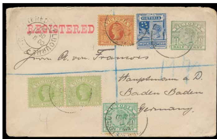
Ex Lot 205

205 PS Postal Stationery with Tasmania 2½d Envelope 'DIANA'S BASIN...'; Victoria 1d Postal Card with 'REPLY' Barred-Out (rare, but stained), three uprated Letter Cards to Germany (one taxed), ½d green STO Envelope uprated & registered to Germany (philatelic but rare), 1d 'OS' Education Department Envelopes x3 used, and a few others; and Western Australia 1½d Postal Card unused (rare, but stained) & CTO; condition variable. (18 items)