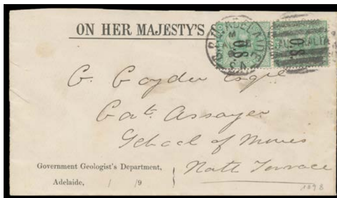
Ex Lot 478