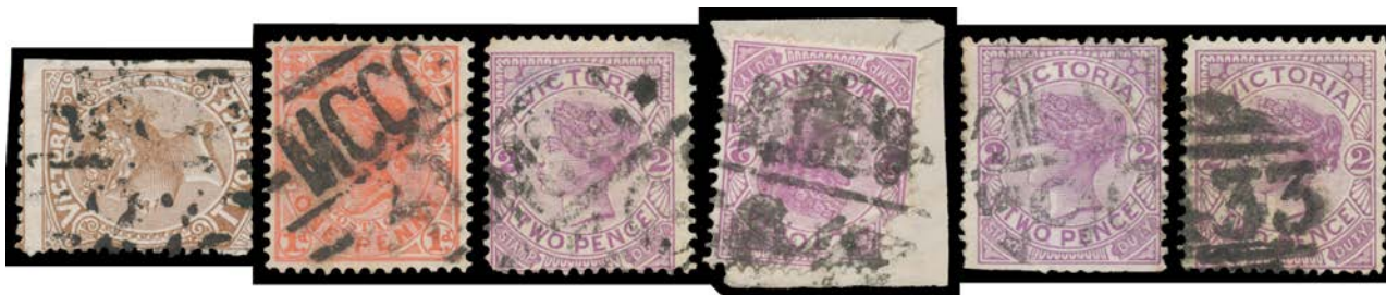
Ex Lot 614

614 SD '901' to 'MCCCC/98' including '923'[1], 'MCC/27', 'MCC/61', 'MCCC/24', 'MCCC/31', 'MCCCC/36' & 'MCCCC/64' all rated RRRR, and '918' (?), '925' (?), '1433', 'MCCCC/84' (?) & 'MCCCC/96' all rated RRRRR. (100s) 1,750