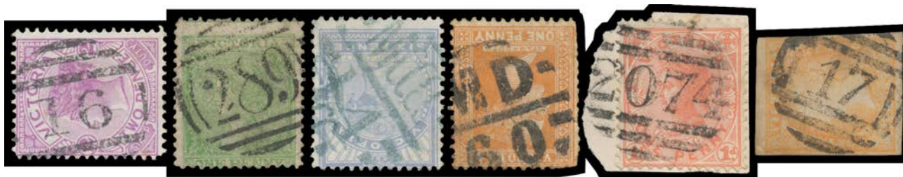
Ex Lot 609