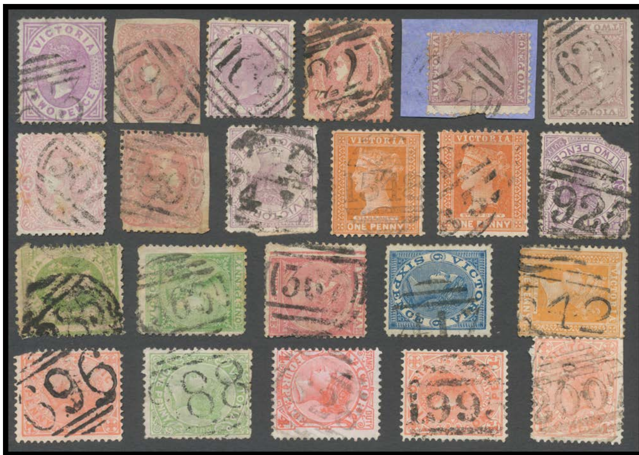
Ex Lot 610