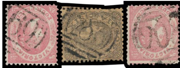
Ex Lot 612