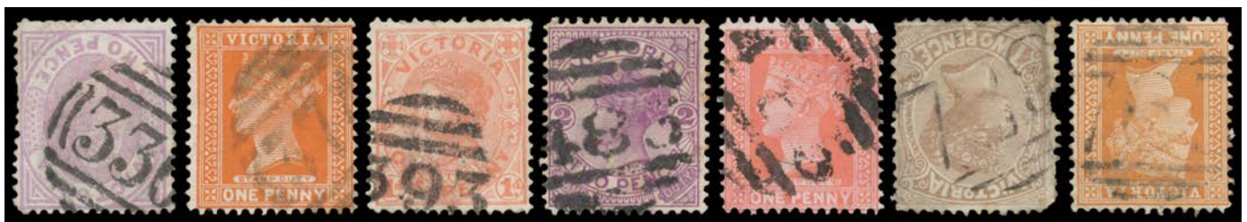
Ex Lot 613