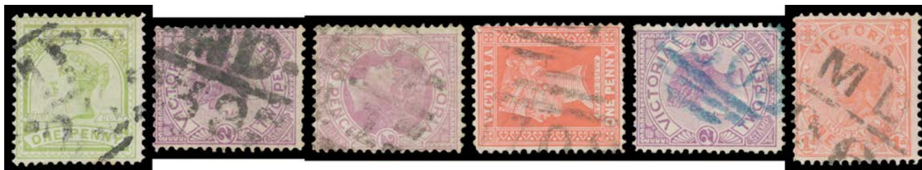
Ex Lot 615

614 SD '901' to 'MCCCC/98' including '923'[1], 'MCC/27', 'MCC/61', 'MCCC/24', 'MCCC/31', 'MCCCC/36' & 'MCCCC/64' all rated RRRR, and '918' (?), '925' (?), '1433', 'MCCCC/84' (?) & 'MCCCC/96' all rated RRRRR. (100s) 1,750