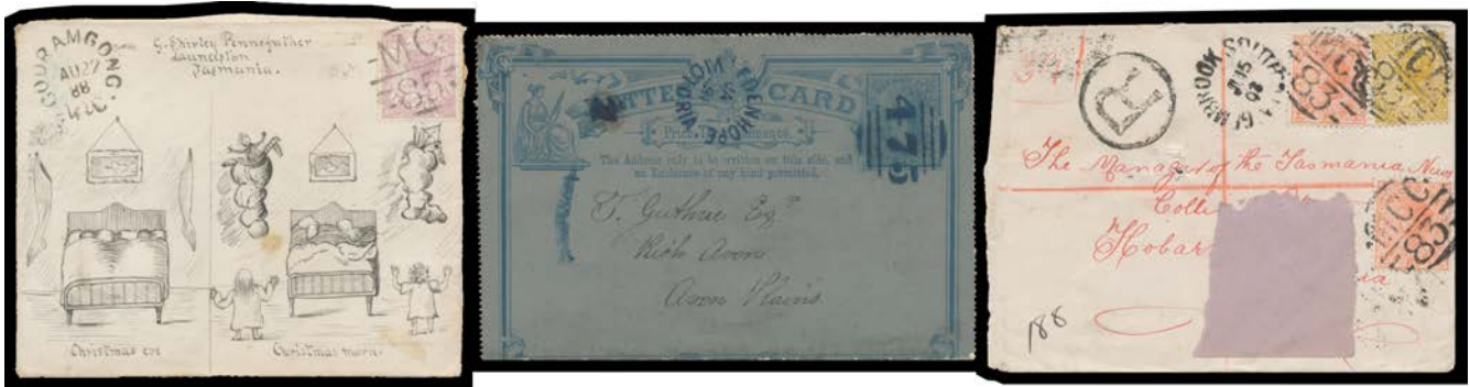
Ex Lot 611