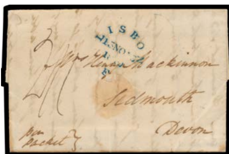
Ex Lot 1001

1001 C B 1810 (Nov 4) Peninsular War entire to Devon with very fine strike of the scarce 'LISBON/ F' transit d/s in blue applied at Falmouth (Cornwall), rated "2/1", internal repairs & wax seal-stain still most presentable; 1812 (May) entire from Ciudad Rodrigo (Spain) to Lancashire with the same d/s of MY22/1812 (LRD by two years) in blue, rated "2/5"; and 1841 to Wiltshire with the same marking - with the date removed - on the reverse, rated "2/9". David Weeden's 1810 usage of the 'LISBON/ F' cds sold for £345. His 1842 usage with the date removed sold for £161. [The first written at Malveira, 30km N of Lisbon, by a British soldier who states "...I certainly now see no end to the war campaigns... What a mess up that scoundrel Bonaparte makes in the world...People in [Lisbon] have recovered from their fright and all trade is back again..."] (3)