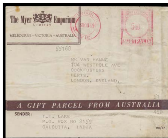
Ex Lot 175

175 C (B)/B - 1948 Myer Emporium label as for the embossed issues but unstamped, to Hampshire with 5/10d meter, repaired internal tear; also similar 1949 Myer label of similar format but with a more formal corporate logo & the text reset, also with 5/10d meter, somewhat soiled. [Remarkably, the sender of the second item was resident in India! Food rationing in Britain ended only in July 1954, nine years after WWII ended] (2)