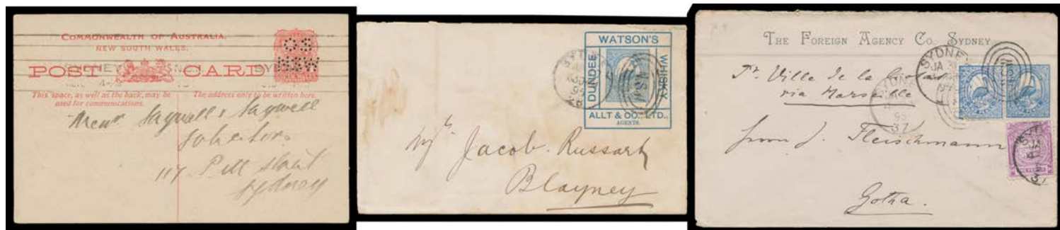
Ex Lot 338