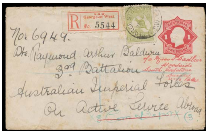
Ex Lot 178