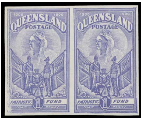
Ex Lot 422

422 P/V A 1900 Boer War Charity 1d imperforate colour trials in deep blue-green, pale yellow-green, indigo & a pair in violet-blue, plus the issued stamp CTO. (6)