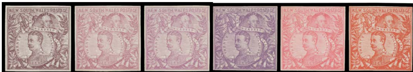
Ex Lot 289

289 P A/A- - all-different imperforate colour trials on ungummed unwatermarked paper comprising 1d x4, 2d x6, 4d x6, 6d x10, 8d x8, 1/- x6, 5/- & 20/- x10, all but one 2d with full margins, a couple of minor blemishes. Largely complete & colourful array. Most of these are Ex John Bell (NSW) . [65 different proofs have been recorded, with between 6 and 12 of each, some of which remain in blocks of 4] (51)