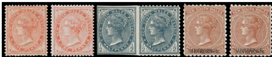
Ex Lot 274