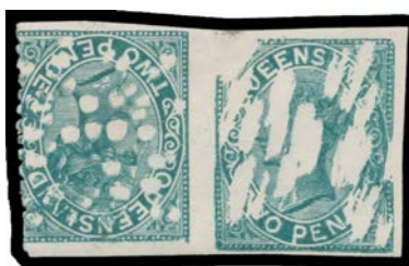
Ex Lot 204

204 OP Oddments on stockcards including NSW Laureates 1d forgery pair, Queensland Lined Background 2d defaced plate proof tête-bêche pair, postmark interest including Victorian BN 'M52' superb strike (rated RR), condition variable. (119 items) 400 T