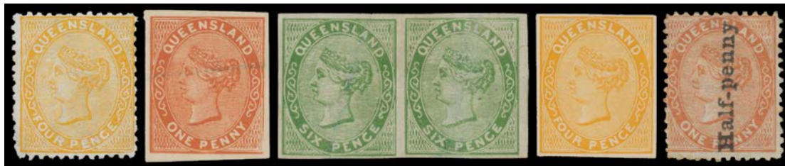
Ex Lot 406