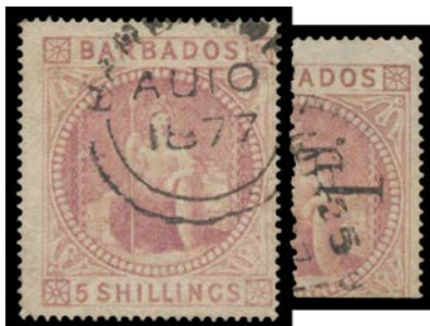
Ex Lot 858

858 P/OC A BARBADOS: Nice little lot of Britannias comprising Blued Paper 1d deep blue, White Paper ½d yellow-green & 1d deep blue, Imperf 6d rose-red, above-average 5/- rose, 'HALF PENNY' plate proof in black, and '1D.' on 5/- bisect SG 86, Cat £1300; also 1850 entire from Trinidad (b/s) & 1856 to Trinidad with 1d blue (full margins but small corner fault) and 'JU5/1856' b/s with no inscription. (7 + 2 covers)