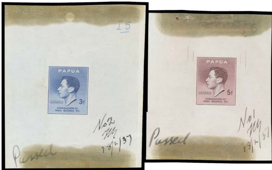
Ex Lot 967

967 P C 1937 Coronation of KGVI 1d to 5d die proofs in the issued colours on thin highly surfaced paper (55x66mm or slightly larger) each with various endorsements dated between 17th & 22nd Feb 1937, the 3d & 5d also with "Passed" at the base, 'sticky tape' stains at the top & base that fortunately don't impact on the designs. Ex EC Harris Archive : sold at the Prestige auction of 12.10.2012 for $8912. Chris Ceremuga Certificate (2012) states "Great rarity being the only full set recorded". (4) 4,000