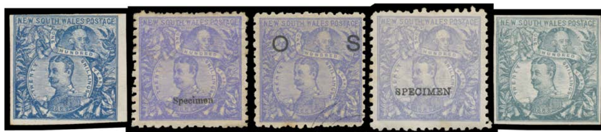
Ex Lot 286

286 */**V - 1888-89 Centennial of New South Wales including imperf colour trials 1d x2, 6d x3, 8d & 20/- x2, then 2d pair with 'INSPECTOR GENERAL' h/s, 5/- 'SPECIMEN' Overprint, 20/- x3 plus 'Specimen' & 'SPECIMEN' Overprints; 'OS' Overprints 1d pane of 60, 5/- (creased) & 20/- CTO, and a few others; generally fine to very fine. (100+)