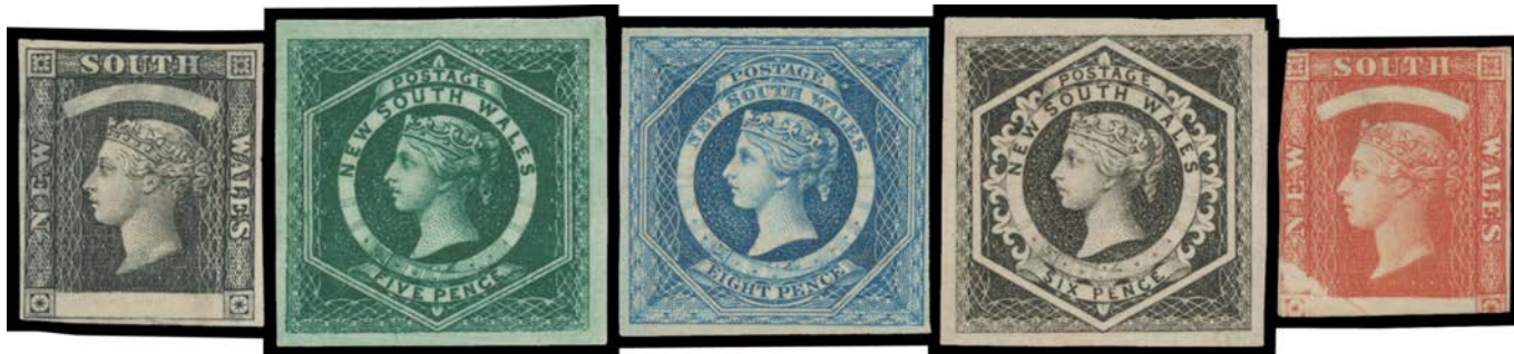
Ex Lot 243