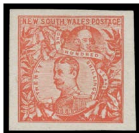
Ex Lot 290