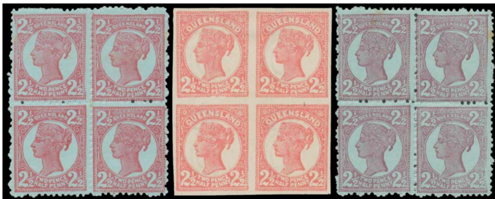
Ex Lot 414