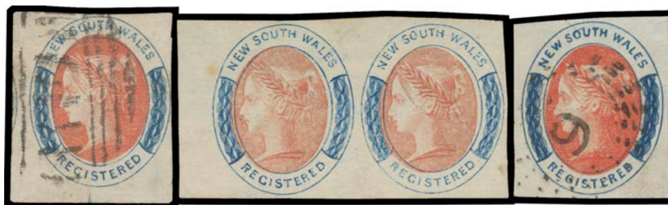
Ex Lot 251