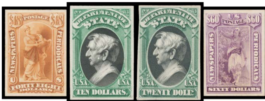
Ex Lot 1043

1043 P A OFFICIALS - PLATE PROOFS ON CARD : Newspaper Stamps 24 values to $60 violet; Interior Department eight values in vermilion to 30c, Agriculture Department nine values in yellow to 30c, War Department six values to 24c, and State Department fifteen values to $20. Very attractive lot. (62) 600