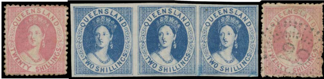
Ex Lot 405