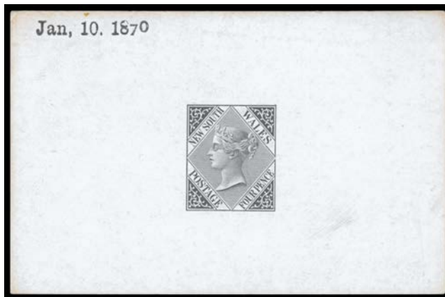
Ex Lot 275

275 P A - De La Rue 1d 2d & 4d die proofs in black on highly surfaced cards (93x61mm), 1d & 4d with 'Jan 10 1870' h/s at upper-left, none of the surface rubbing one sometimes encounters. (3)