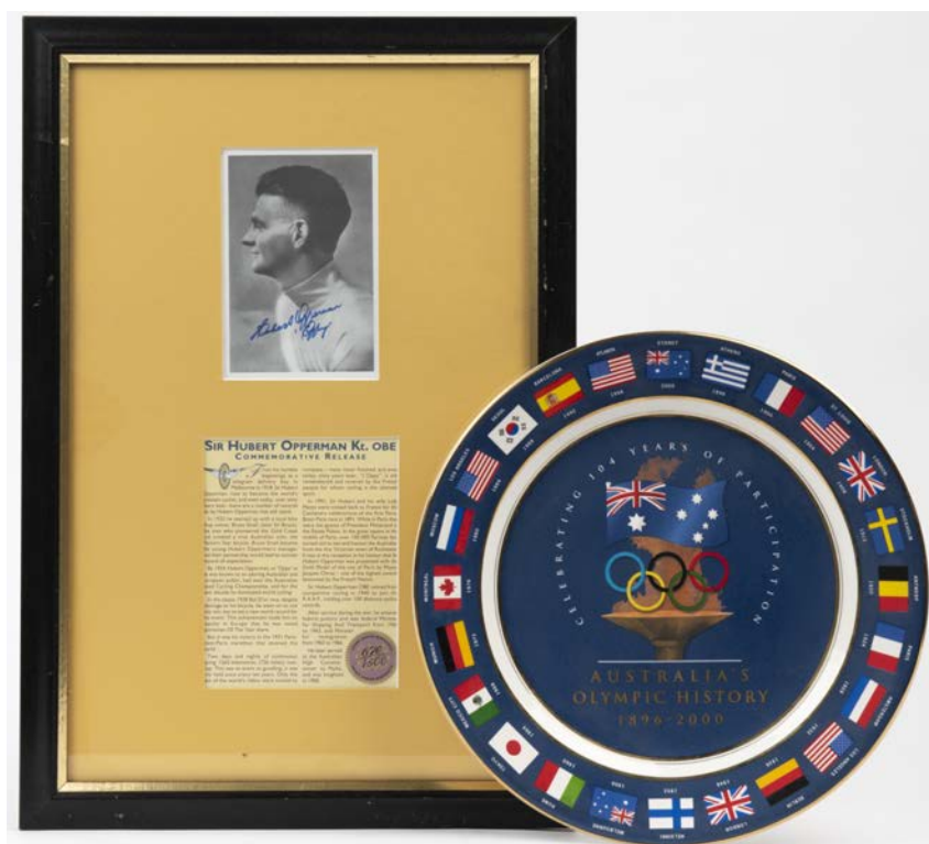
Ex Lot 2199