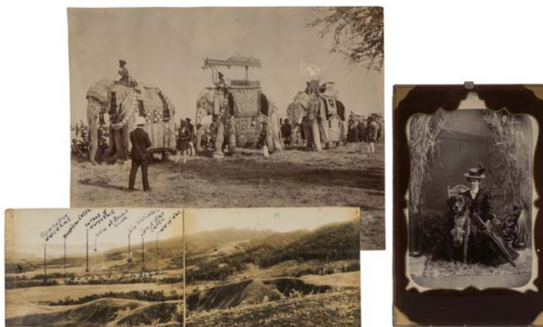
Ex Lot 2449