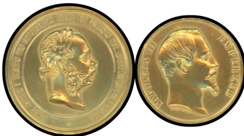
Ex Lot 2504