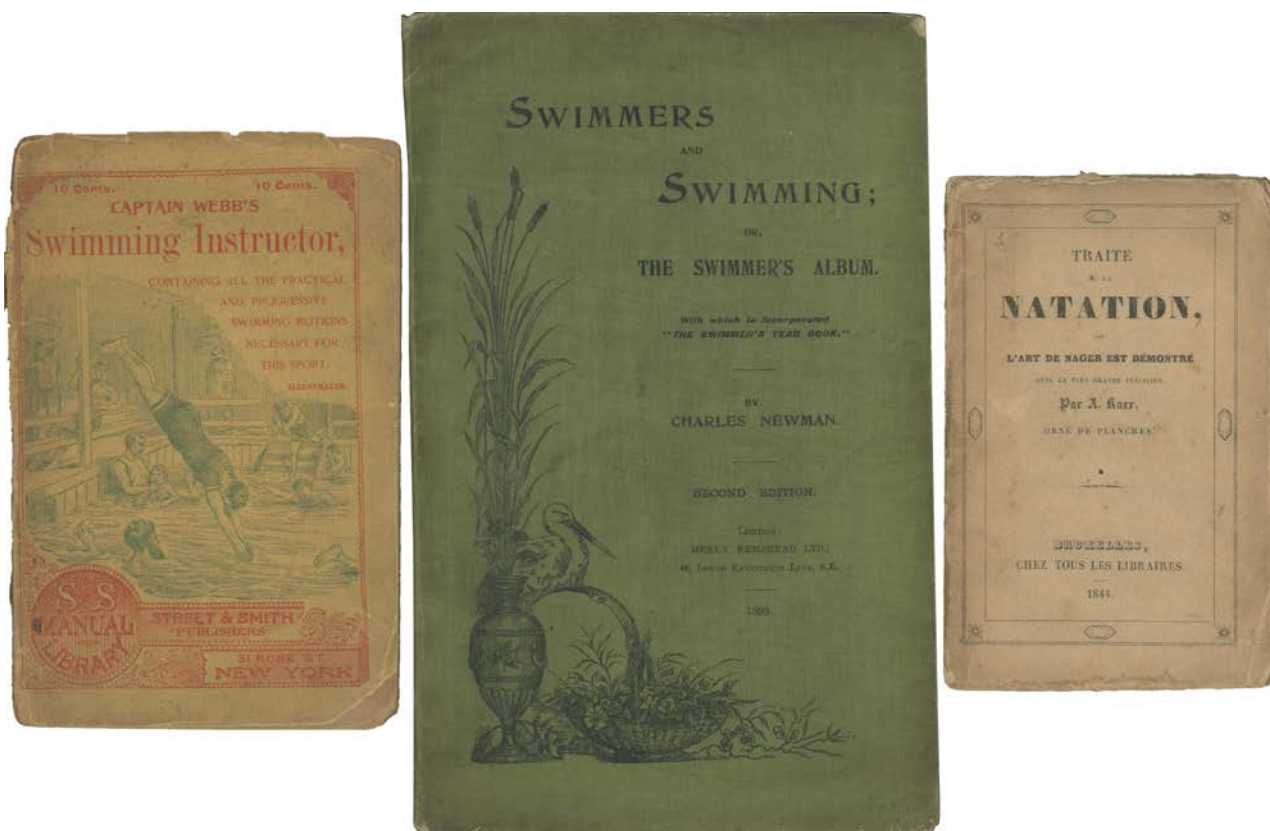
Ex Lot 2396

2396 - SWIMMING LIBRARY, ex Harry Gallagher collection , noted 'Traite de la Natation' by Karr [Bruxelles, 1844]; 'Captain Webb's Swimming Instructor' [New York, 1891]; 'Petit Cours de Natation' by Cooreman [Bruxelles, 1891]; 'Swimmers and Swimming' by Newman [London, 1899]; 'The Outline of Swimming' by Bachrach [Chicago, 1924]; also four titles by Harry Gallagher - these all signed. (13 items)