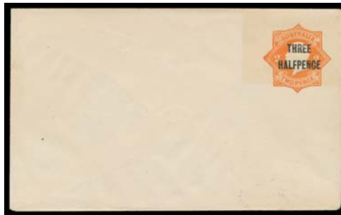
Ex Lot 188