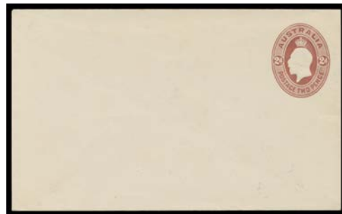
Ex Lot 192