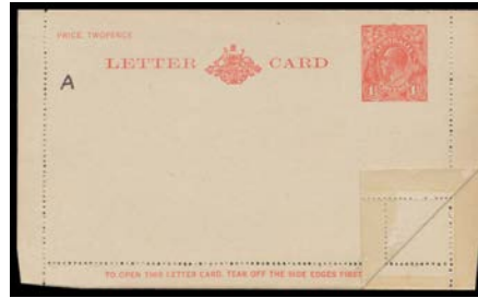
Ex Lot 232