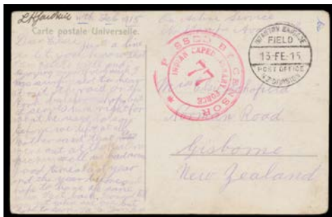
Ex Lot 1207