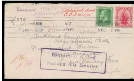
Ex Lot 1240

1239 C B - 1915 (July 14) cover from Timaru to a member of the "Main Expeditionary Force" endorsed "Dec'd" in blue pencil & with appallingly blunt 'KILLED/RETURN TO/SENDER' cachet (not recorded by John Firebrace ) in violet, minor peripheral defects. Ex Gordon Darge . 300