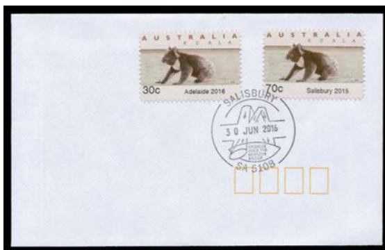
Ex Lot 181

181 C A - 30c Koala on the Ground + '70c Salisbury 2015' in the same design, & '$1.00 Adelaide 2016' Group of Koalas, tied to unaddressed covers by 'SALISBURY/30JUN2016/JINDALEE/OVER THE/HORIZON/RADAR/...' pictorial cds. [This was the last date on which the Monarch printer used to produce the text was used] (2 covers)