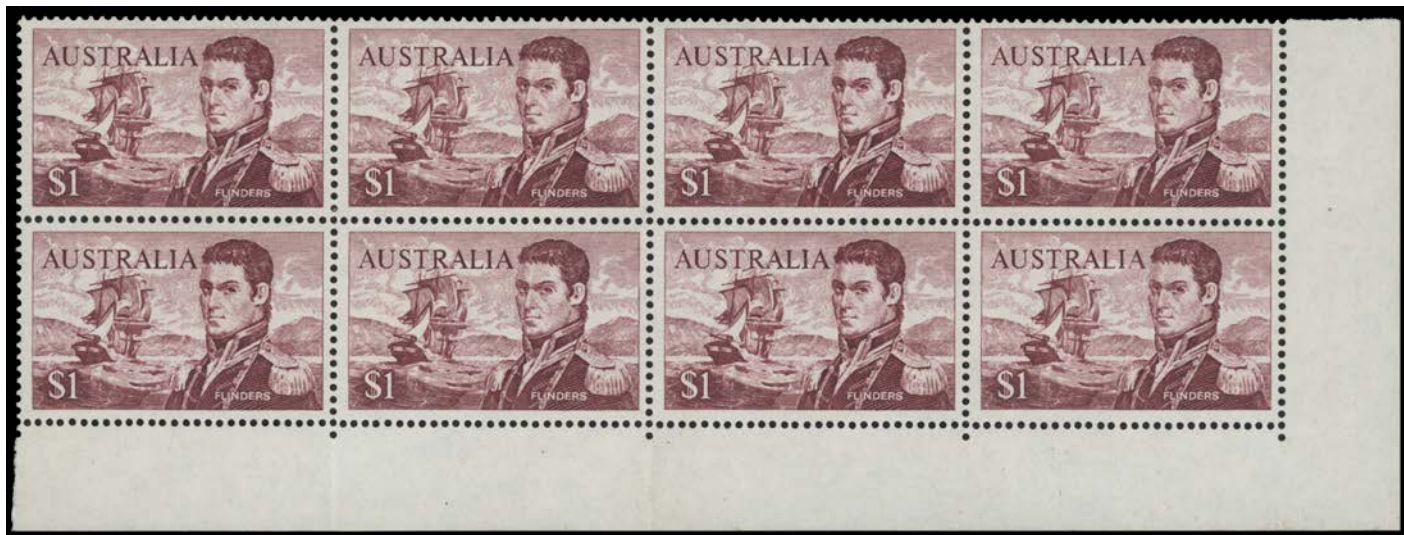
Ex Lot 167