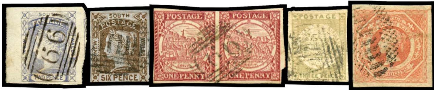
Ex Lot 498