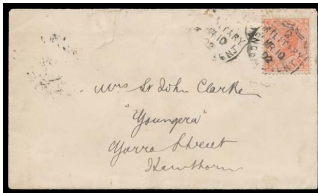
Ex Lot 478