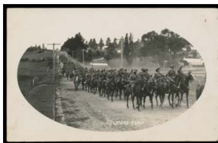
Ex Lot 483