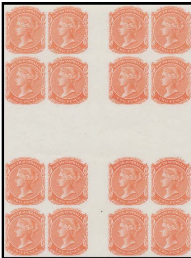
Ex Lot 558