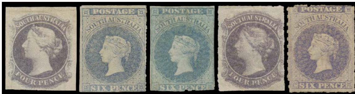
Ex Lot 551

551 Ω* A/A- 1860-69 Second Roulettes shades between SG 19 & 31 comprising 1d x6, 2d pale vermilion, 4d x2 and 6d x3 including violet-ultramarine, a few with part- to large-part o.g., Cat £2300+. (12)