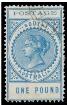
Ex Lot 563

563 V A B1 - 5/- 10/- £1 SG 277-9 all CTO with Adelaide cds ACSC #S32-34x Cat $950 (£415). (3)