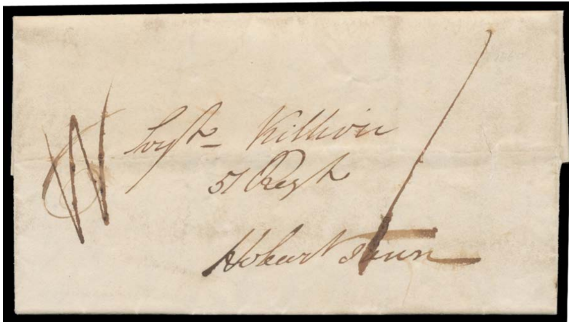
Ex Lot 618