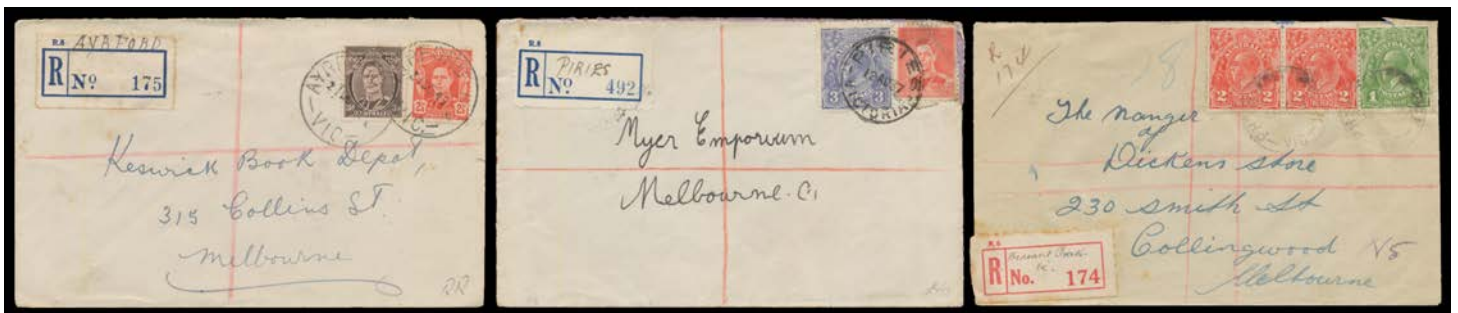
Ex Lot 670

669 SDC Gippsland two volume collection with many better datestamps including 'CALLIGNEE NORTH' (rated RR), 'CLYDEBANK' (RRR), 'COBAINS' (RRR), 'FLYNN' (RR), 'FOSTER NORTH' (RRR), 'FULHAM' SDL (RRR), 'FULHAM RLY STATION' (RRR), 'GIFFARD' (RRR), 'HEATH HILL', 'JEETHO/VIC-AUST', 'JENSEN'S' (a Danish Settlement), 'JUMBUK', 'KILMANY SOUTH', 'KORRINE', 'LOY YANG', 'MACK'S CREEK', 'MILFORD GRANGE', 'PARADISE BEACH', 'STRADBROKE', 'STRADBROOK', 'STREZLECKI', 'STRZELECKI', 'TARRAVALLE', 'THE HEART', 'THORPDAL SOUTH', 'YANNATHAN LOWER', etc, a few covers including with 'MIL PO FOSTER No 1' (RR) & 'TO GLENGARRY' (RR), also '2 /MILITARY/JA15/02/ENCAMPMENT' used at Langwarrin, useful registration labels including "Reds". A very good lot but rather untidy so close inspection is recommended. (many 100s) 2,000