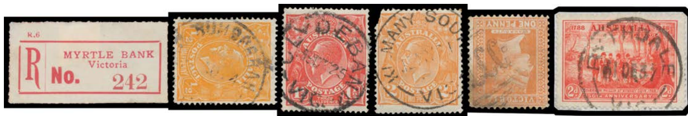
Ex Lot 668