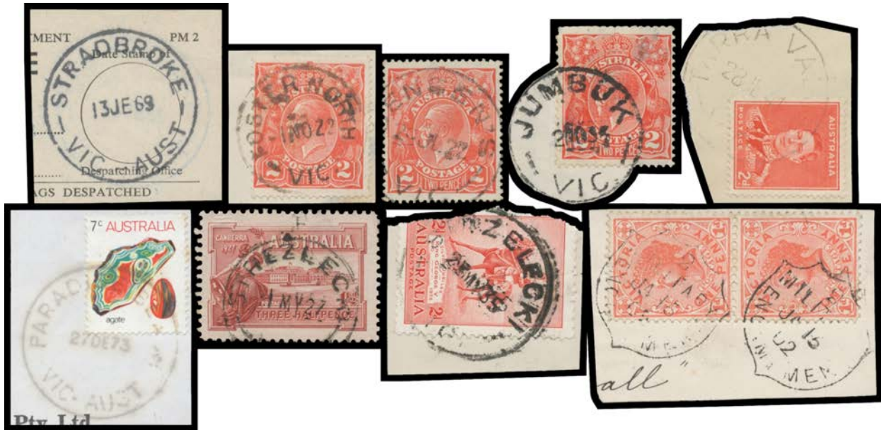
Ex Lot 669

669 SDC Gippsland two volume collection with many better datestamps including 'CALLIGNEE NORTH' (rated RR), 'CLYDEBANK' (RRR), 'COBAINS' (RRR), 'FLYNN' (RR), 'FOSTER NORTH' (RRR), 'FULHAM' SDL (RRR), 'FULHAM RLY STATION' (RRR), 'GIFFARD' (RRR), 'HEATH HILL', 'JEETHO/VIC-AUST', 'JENSEN'S' (a Danish Settlement), 'JUMBUK', 'KILMANY SOUTH', 'KORRINE', 'LOY YANG', 'MACK'S CREEK', 'MILFORD GRANGE', 'PARADISE BEACH', 'STRADBROKE', 'STRADBROOK', 'STREZLECKI', 'STRZELECKI', 'TARRAVALLE', 'THE HEART', 'THORPDAL SOUTH', 'YANNATHAN LOWER', etc, a few covers including with 'MIL PO FOSTER No 1' (RR) & 'TO GLENGARRY' (RR), also '2 /MILITARY/JA15/02/ENCAMPMENT' used at Langwarrin, useful registration labels including "Reds". A very good lot but rather untidy so close inspection is recommended. (many 100s) 2,000