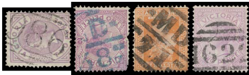
Ex Lot 662