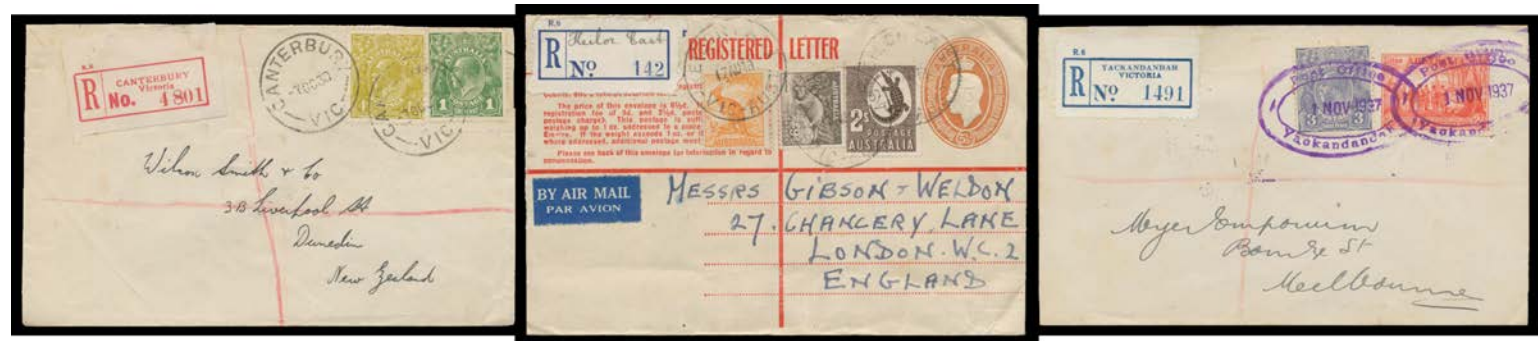
Ex Lot 671

670 C KGV to early-QEII commercial registered covers with provisional labels mostly with manuscript endorsements plus some handstamped or typewritten, cds include 'ARMYTAGE' (rated R), 'AYRFORD___' (RR), 'BARINGHUP WEST' (RR), superb 'BENLOCH' (RR), 'DEEP LEAD' (RR), 'DOCTORS FLAT' (R), 'DOUTTA GALLA' (RR), 'EZARDS MILLS' (RR), 'GRASSDALE' (RR), 'HESKET STATE SCHOOL with Inverted Dateline (RRR), 'HOMBUSH', 'HOTHAM HILL', 'KEELY RAIL', 'KELVIN VIEW', 'KULWIN', 'LOVAT', 'LYONVILLE', 'PHEASANT CREEK', 'PIRIES', etc, some red labels included, condition rather mixed. Very scarce group. (100+) 2,000