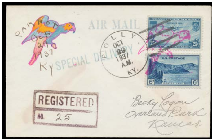
Ex Lot 849