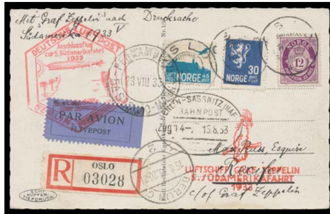
Ex Lot 762