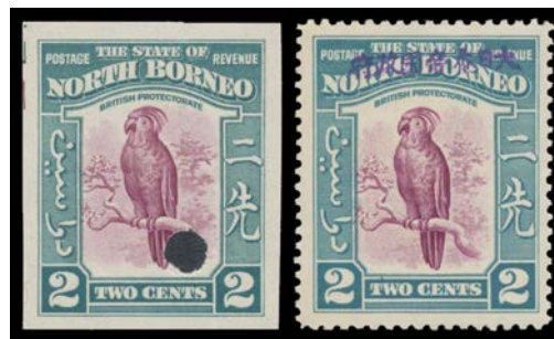
Ex Lot 839

838 * A+ A1 - 1918 'RED CROSS/TWO CENTS' on 12c with the Overprint Inverted SG 224a, lightly mounted, Cat £600. Superb! 400 T