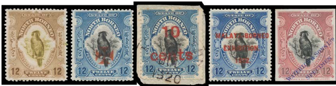
Ex Lot 833