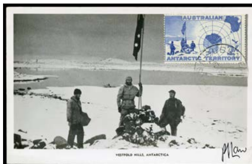
Ex Lot 363