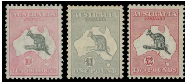
Ex Lot 119