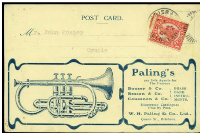
Ex Lot 609