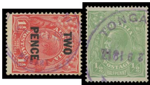
Ex Lot 734

733 PS A/A+ ENVELOPES: 1898 Waterlow & Sons 2d Sideface & 2½d Tablet complete set of the 12 scenic envelopes, generally very fine to superb unused. [Australia's most beautiful Post Office postal stationery issue] (12) 2,000 T