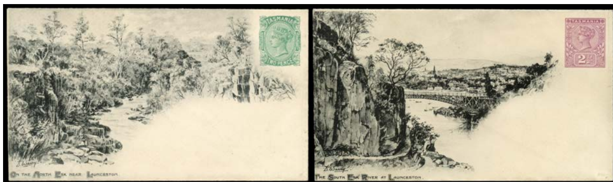
Ex Lot 733

732 CL B 1905 long cover registered to Henri Tobler , Switzerland with Pictorial 1d red (corner fault) and Tablet 1/- rose & green paying quadruple 2½d per ½oz rate plus 3d registration tied by 'LAUNCESTON/JA2/05' cds, chamfered-boxed 'REGISTERED/LAUNCESTON' h/s in blue on face, 'NAPOLI' transit & 'BASEL/-5.II.05/(POSTE RESTANTE)' arrival b/s, minor blemishes & vertical fold not affecting stamps. Rarely seen correctly-rated usage of the 1/- value. 250