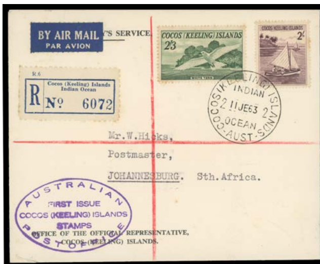
Ex Lot 2500

Cocos' first stamps - 3d to 2/3d only - were issued 11.6.1963. They were available only until 14.2.1966 when decimal currency was introduced & Australian stamps were again used. Correctly franked commercial mail in this brief period is very scarce.