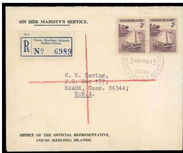
Ex Lot 2504