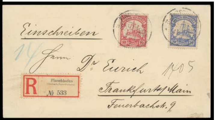
Ex Lot 2544

2544 A/C C 1906-08 registered philatelic mail comprising 1) "coins" PPC to Paris with Yachts 30pf & 'SIMPSONHAFEN' cds, a bit grubby; 2) cover with 10pf & 20pf tied by light 'FINSCHHAFEN' cds; 3) cover with 40pf tied by 'HERBERTSHOHE' cds; and 4) cover with 3pf x2 & 40pf tied by very fine 'FINSCHHAFEN' cds; registration labels Einfeldt #3i 2 8 & 3a; also 5) philatelic cover with Yacht 50pf tied by 'FRIEDRICH-WILHELMSHAFEN' cds & 'Friedrich-Wilhelmshafen/ (Deutsch Neu-Guinea)' h/s in lieu of a registration label. [Registered postcards are very scarce] (5)