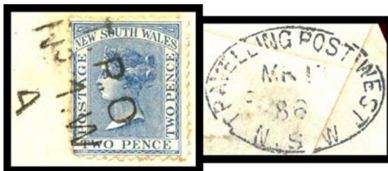
Ex Lot 528

528 SDC Travelling Post Offices: Annotated range of mostly cancels on loose stamps & pieces but with some covers/PPCs including 1886 with 'TPO/No 1 W/ A ' & oval 'TRAVELLING POST WEST' (b/s), 1898 with 'TRAVELLING PO NORTH', 1905 with 'TRAVELLING PO No 2 SOUTH', 1912 with 'TPO 2 SOUTH', 1907 with 'SYDNEY TO WERRIS CK/TPO', etc, condition variable. (approx 100 items) 400 T