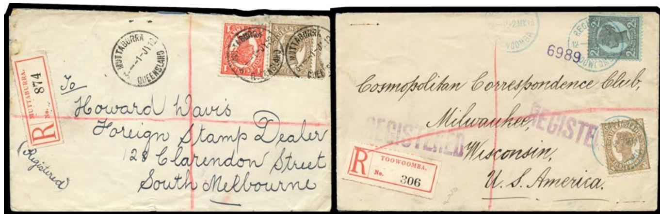
Ex Lot 240

240 C/CL A/B - RED & BLACK/WHITE: 1911-12 commercial and official covers with all-different labels from 'BOROREN', 'BRISBANE', 'DEGILBO', 'DULACCA', 'JUNDAH', 'MUTTABURRA', 'ROCKHAMPTON', 'SOUTHBROOK' (also with 2-line h/s), 'TOOWOOMBA' & 'WETHERON', generally fine to very fine. NB: none of these are Tatts covers. [Although the red & black labels were used into the 1920s & occasionally later - and as a class they are far more accessible than the black labels which preceded them - in the 1910-12 period, they are elusive] (10)