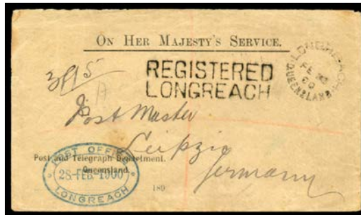
Ex Lot 228