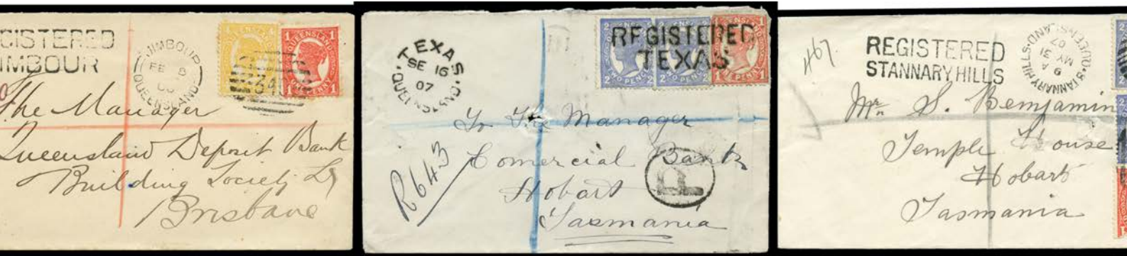
Ex Lot 213