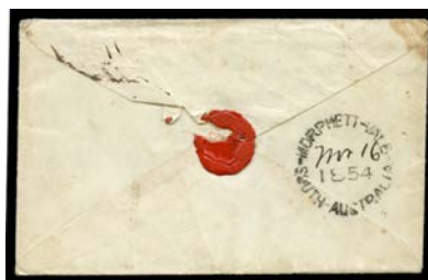
Ex Lot 755