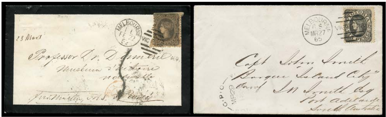
Ex Lot 1191

1190 S B A3 Logan: 'LOGAN/13AU0[9?]/[VICTORIA]' on 1d. PO 18.1.1866. [Gold Mining] 100 T