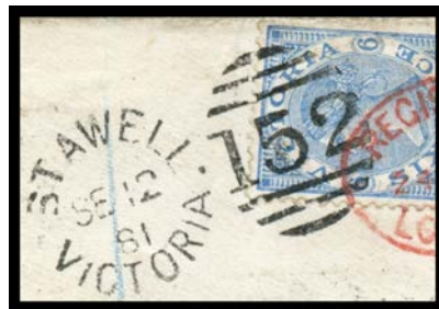
Ex Lot 1212

1212 C A/B Stawell: 1881-90 three registered covers to Scotland with Stawell '152' '265' & '285' duplexes, the last issued in error but still used for 11 months, each with boxed 'REGISTERED' h/s. [Gold Mining] (3)