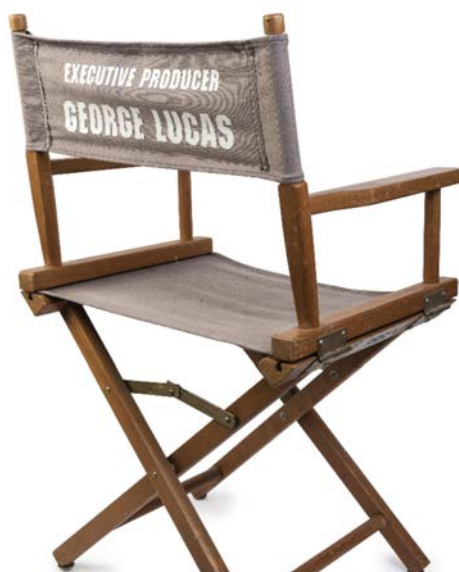
RESERVED GEORGE LUCAS

540 FIDDLER ON THE ROOF (1971), A script, 194pp of mimeographed typescript, with underlinings and annotations in various inks, signed on the front cover by director of photography Ossie Morris. Provenance: Donated by Oswald Morris (with signed letter) to Christies 2001 National Film & Television School auction. 200