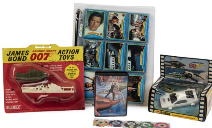
Ex Lot 534