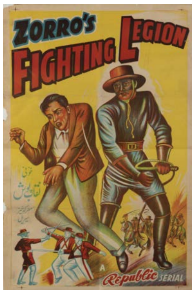
Ex Lot 532